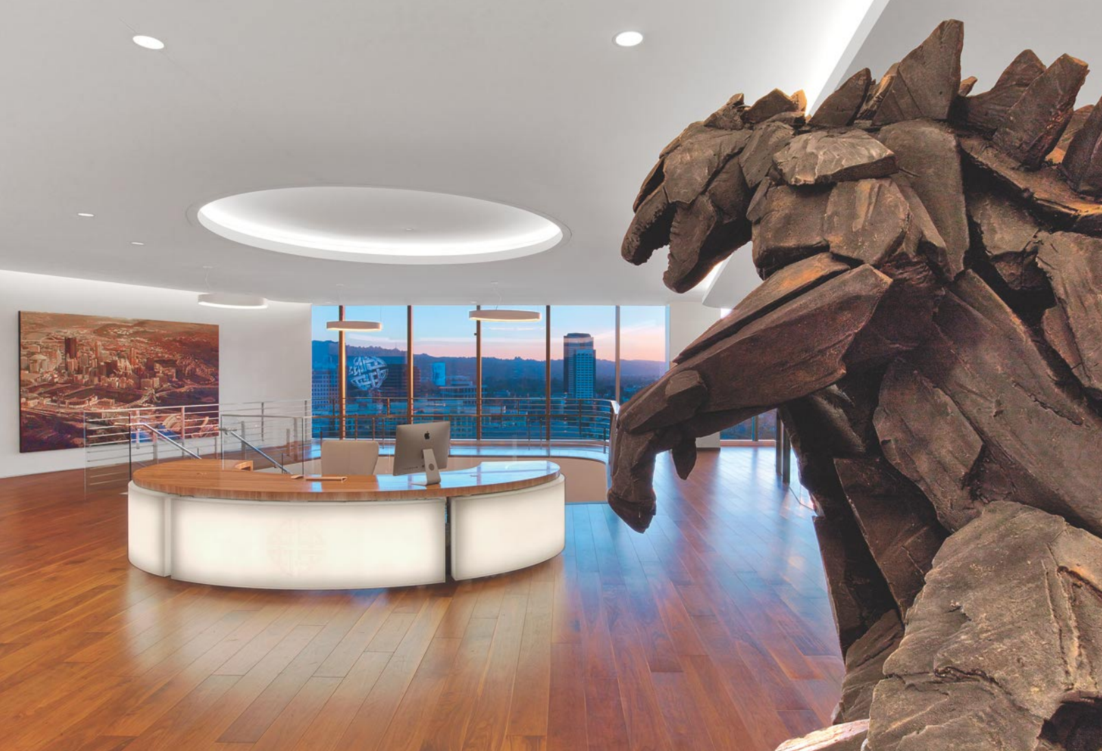
Clockwise from opposite top: An action figure stands next to the light-flooded staircase. Godzilla, in abstracted form, looms over the reception desk. The company's distinctive shield knot logo appears on the boardroom wall. Floor-to-ceiling windows survey the city. A custom carpet evokes Hollywood's Art Deco past.